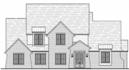
FRONT ELEVATION - 9261 CADDO ROAD, CA

5 Beds | 4.5 Baths | 3,866 SQ FT | 3 Car Garage | 2 Story