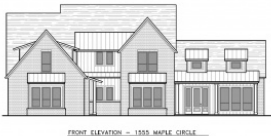
FRONT ELEVATION - 1555 MAPLE CIRCLE

5 Beds | 4 Baths | 3,130 SQ FT | 2 Car Garage | 2 Story